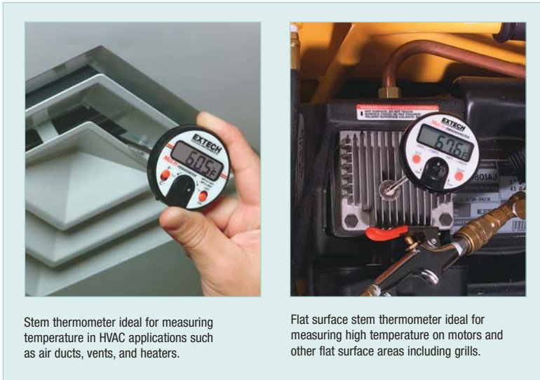
Stem thermometer ideal for measuring temperature in HVAC applications such as air ducts, vents, and heaters.