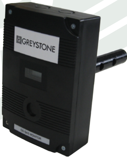
ABS Duct Enclosure for CO

Environmental, industrial and commercial indoor Carbon Monoxide (CO) gas detector. Available in both a space and duct mount version.