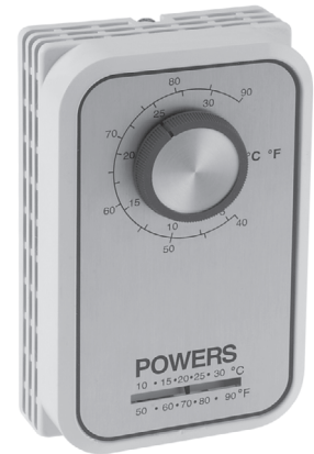
134 Electric Line Voltage Room Thermostat—Heating/Cooling.